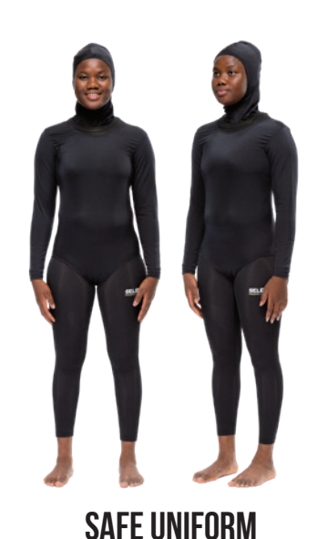
Long sleeve leotard with leggings or bike shorts. Secure fitted head covering