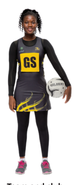
Team and club