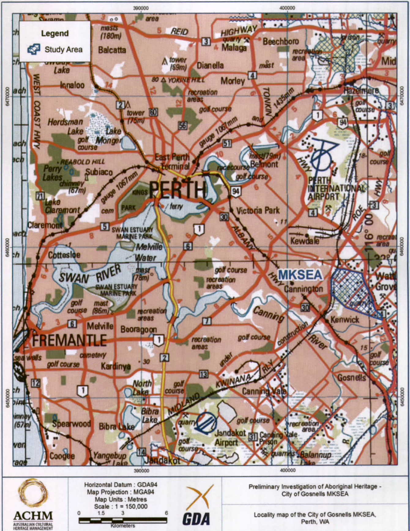
Figure 1 Locality map of the City of Gosnells MKSEA, Perth, WA