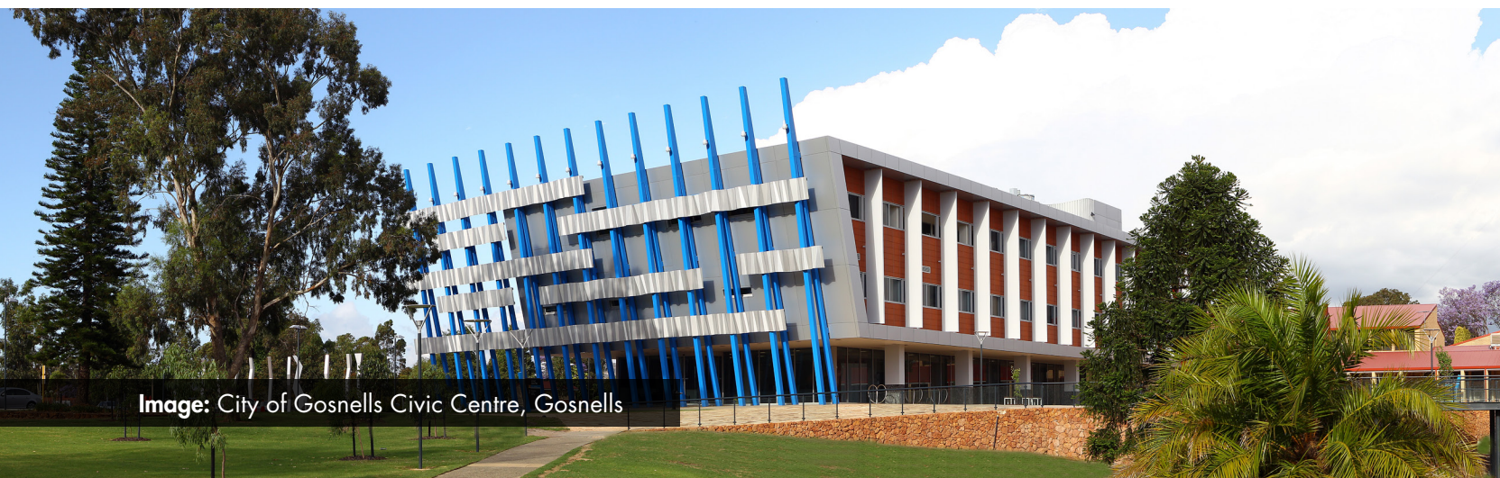
Image: City of Gosnells Civic Centre, Gosnells