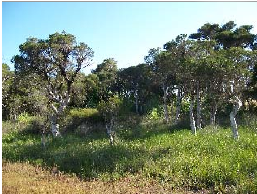
CITY OF GOSNELLS MADDINGTON / KENWICK STRATEGIC INDUSTRIAL AREA FIGURE 9 : WETLAND EVALUATION - WETLANDS 13825, 13826 & 13827