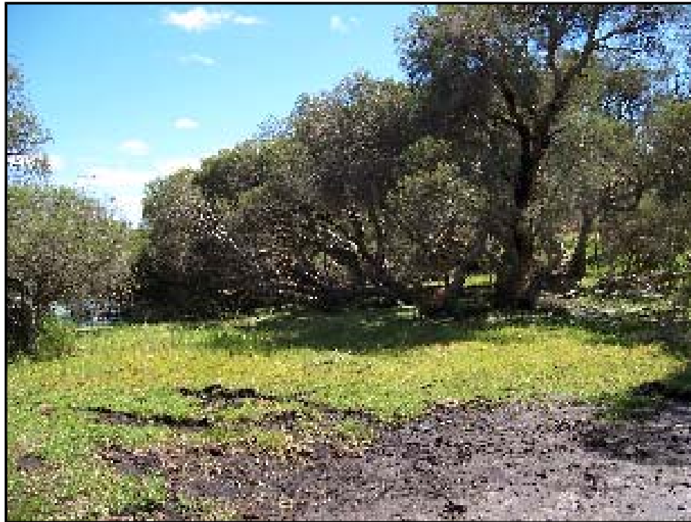
CITY OF GOSNELLS MADDINGTON / KENWICK STRATEGIC INDUSTRIAL AREA FIGURE 8 : WETLAND EVALUATION - WETLAND 7647