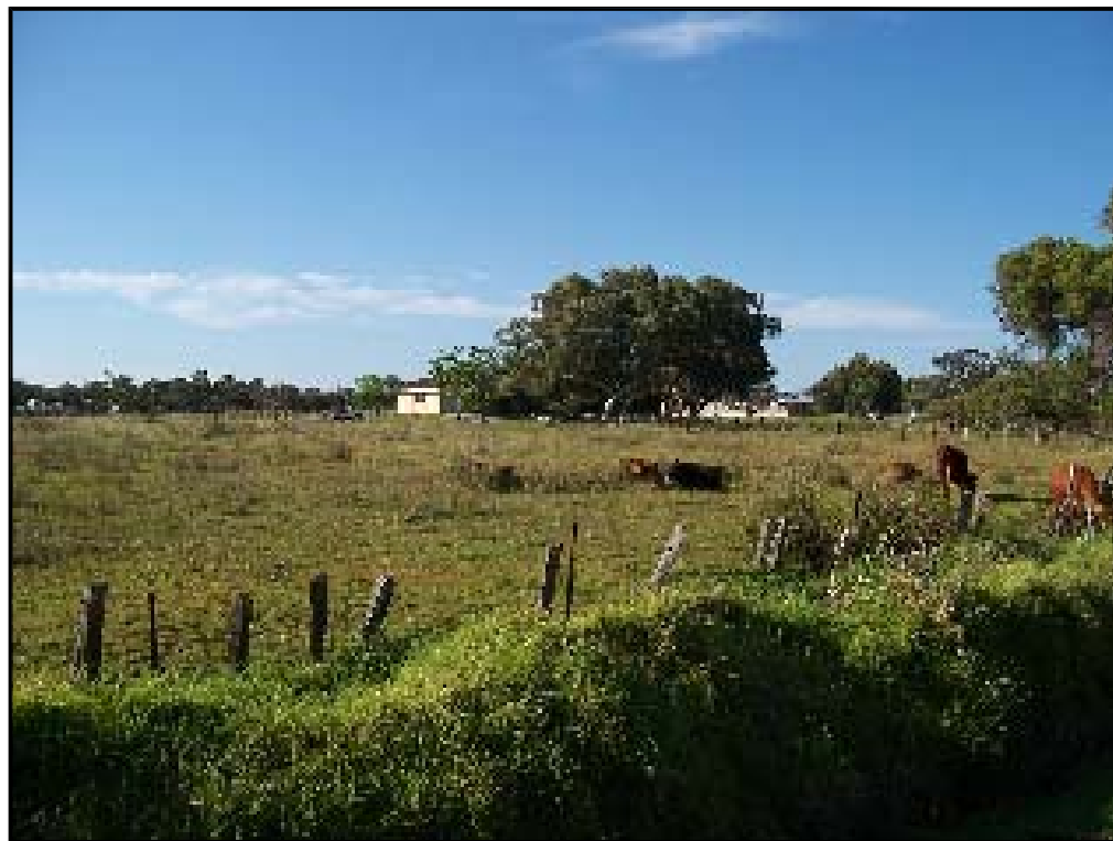
CITY OF GOSNELLS MADDINGTON / KENWICK STRATEGIC INDUSTRIAL AREA FIGURE 7 : WETLAND EVALUATION - WETLAND 7778