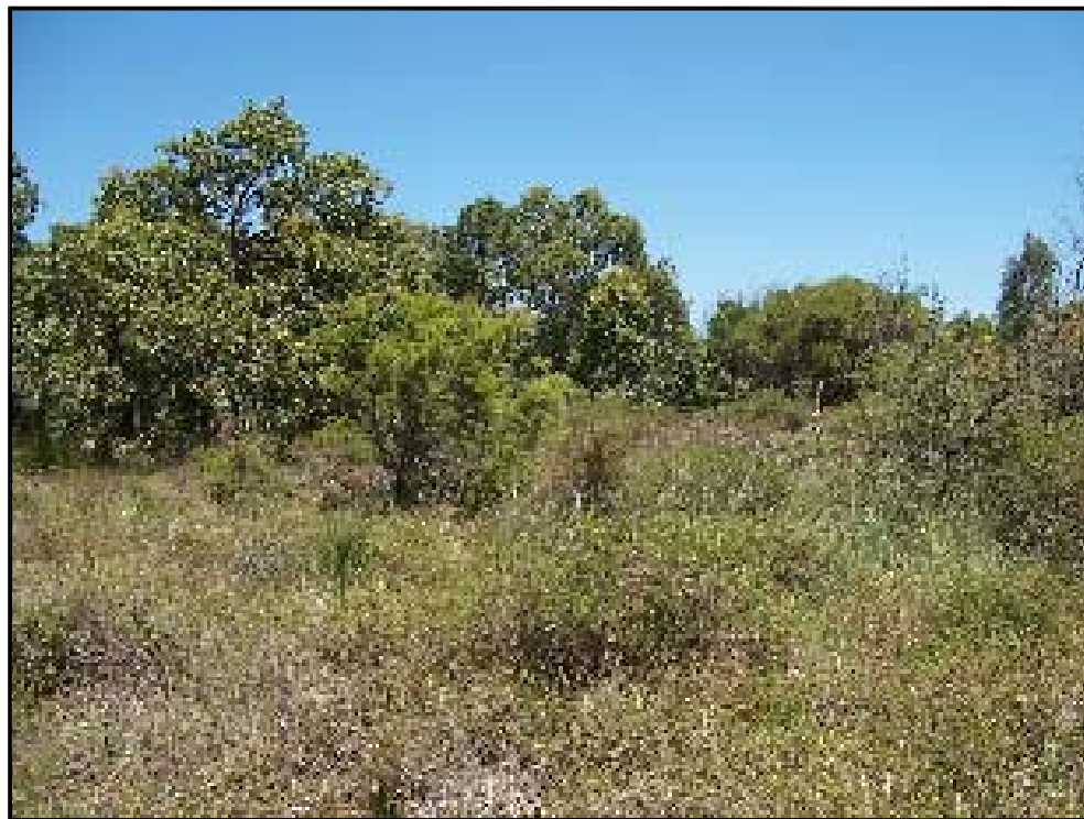
CITY OF GOSNELLS MADDINGTON / KENWICK STRATEGIC INDUSTRIAL AREA FIGURE 11 : WETLAND EVALUATION - WETLAND 8050