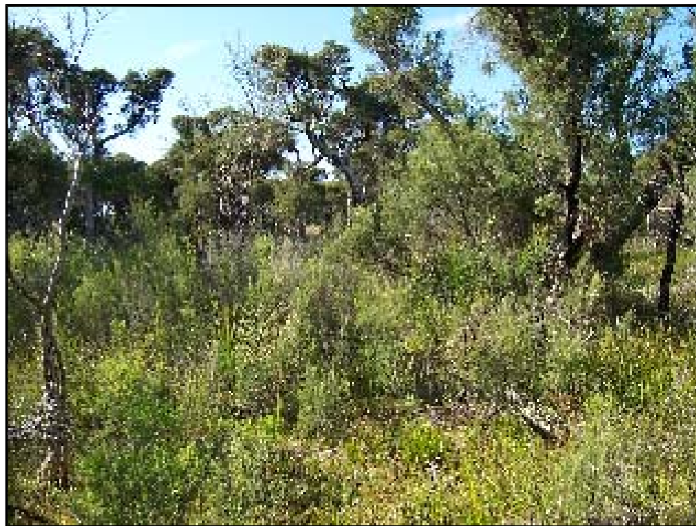
CITY OF GOSNELLS MADDINGTON / KENWICK STRATEGIC INDUSTRIAL AREA FIGURE 10 : WETLAND EVALUATION - WETLAND 8038