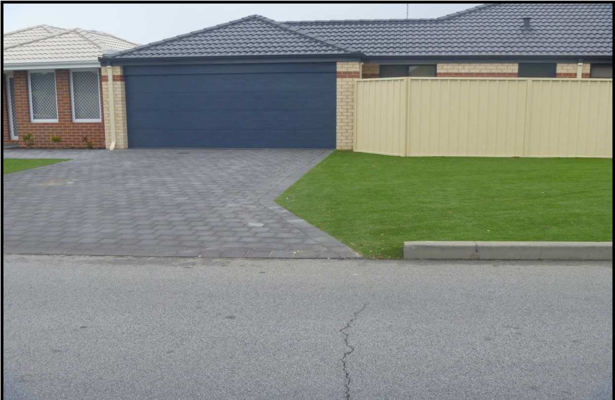
Figure 5 - No kerb - Non- Compliant