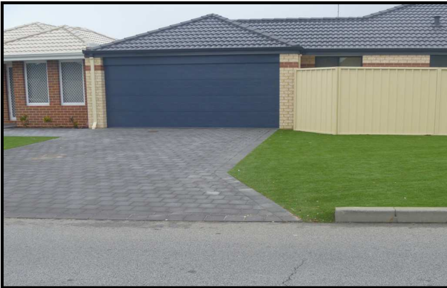
Figure 2 - Brick pavers abutting the road surface - Not permitted