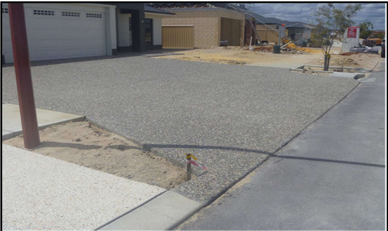
Figure 6 - Crossing constructed through path, too wide, too close to side entry pit and incorrect kerb replacement- Non-compliant