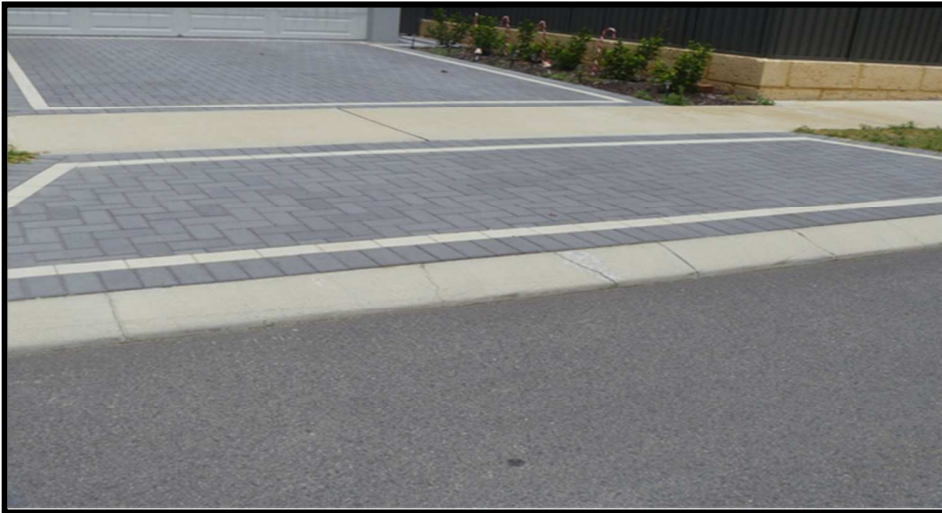
Figure 1 - Existing concrete path - Compliant

Where there is damage to a portion of the existing path that is in the area where you wish to construct your crossing, you must contact the City. Telephone: Engineering Operations on 9492 0111.