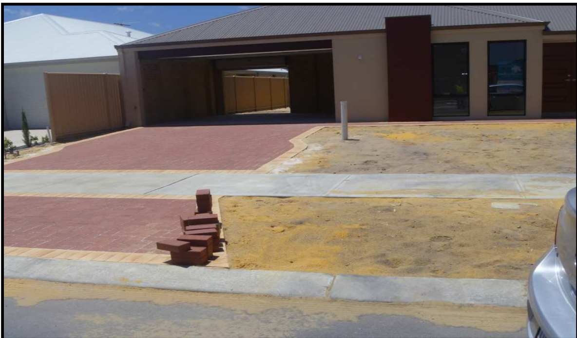
Figure 4 - Brick crossing with path - Compliant